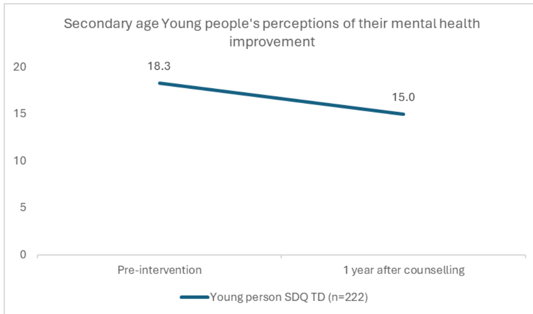
Figure2: Young people's Total Difficulties scores (mean) before counselling and one year after the end of counselling

Young people themselves consider their mental health is significantly better one year after the end of Place2Be's counselling, compared to before counselling: